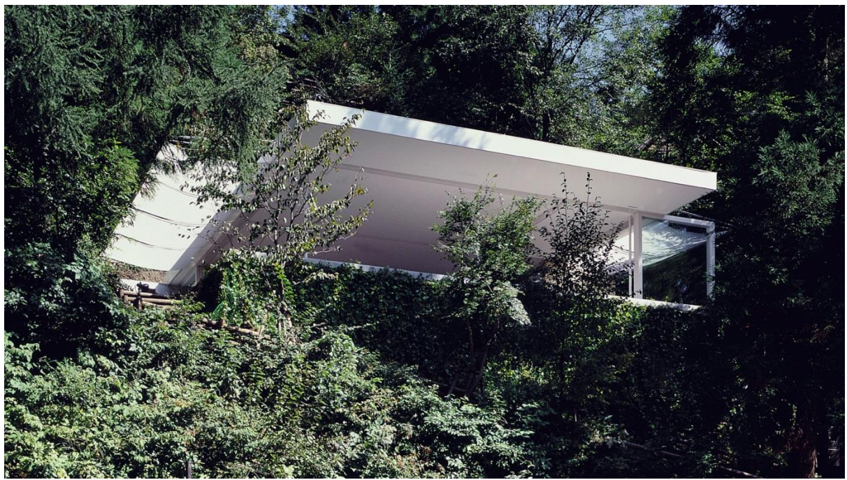
Figure 1: Shigeru Ban's "House Without Walls."

[High modernism] is best conceived as a strong, one might even say muscle-bound, version of the self-confidence about scientific and technical progress, the expansion of production, the growing satisfaction of human needs, the mastery of nature (including human nature), and, above all, the rational design of social order commensurate with the scientific understanding of natural laws. (Scott, 1998: p. 4)