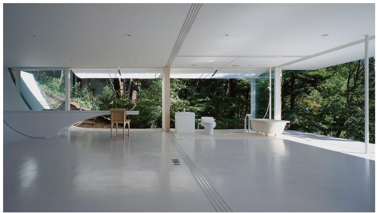
Figure 2: The interior of Ban's House Without Walls.

In its clean, sterile and almost surgical whiteness, this building could have been the backdrop for a science-fiction movie. As we'll see in section 3, it's not surprising then that Ridley Scott's 2018 movie Alien: Covenant contains an opening scene that feels eerily like Ban's House Without Walls .