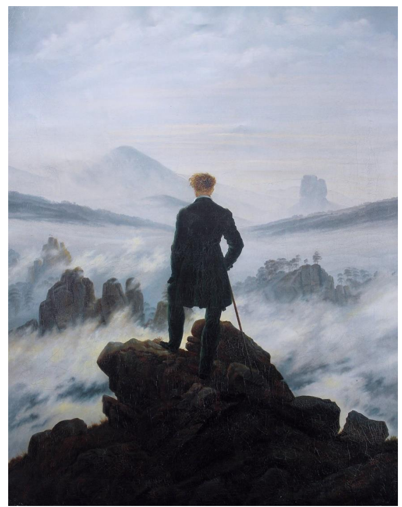
Figure 3: "Wanderer Above the Sea of Fog," by Caspar David Friedrich (1818).

One of the paradigmatic figures of high modernity is perhaps not a historical individual, but the lonesome wanderer overlooking the clouds in Caspar David Friedrich's 1818 painting Wanderer Above the Sea of Fog :