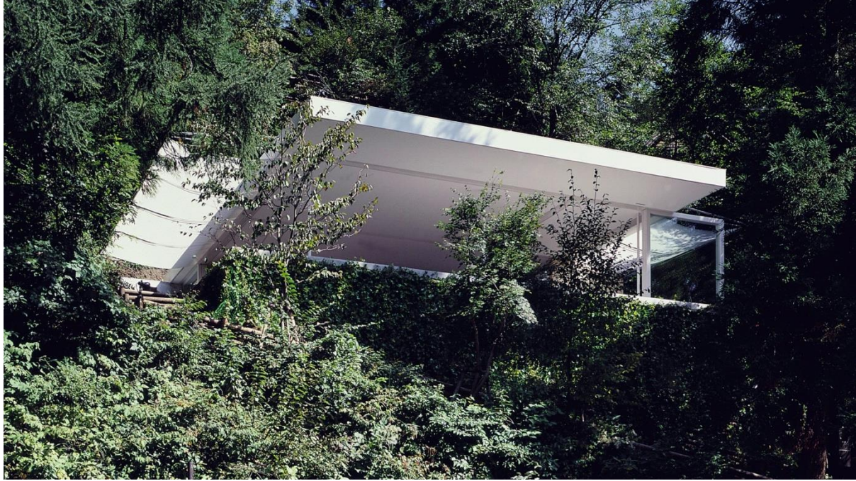
Figure 1: Shigeru Ban's "House Without Walls."

[High modernism] is best conceived as a strong, one might even say muscle-bound, version of the self-confidence about scientific and technical progress, the expansion of production, the growing satisfaction of human needs, the mastery of nature (including human nature), and, above all, the rational design of social order commensurate with the scientific understanding of natural laws. (Scott, 1998: p. 4)