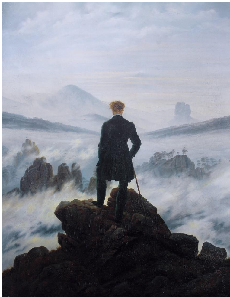
Figure 3: "Wanderer Above the Sea of Fog," by Caspar David Friedrich (1818).

One of the paradigmatic figures of high modernity is perhaps not a historical individual, but the lonesome wanderer overlooking the clouds in Caspar David Friedrich's 1818 painting Wanderer Above the Sea of Fog :