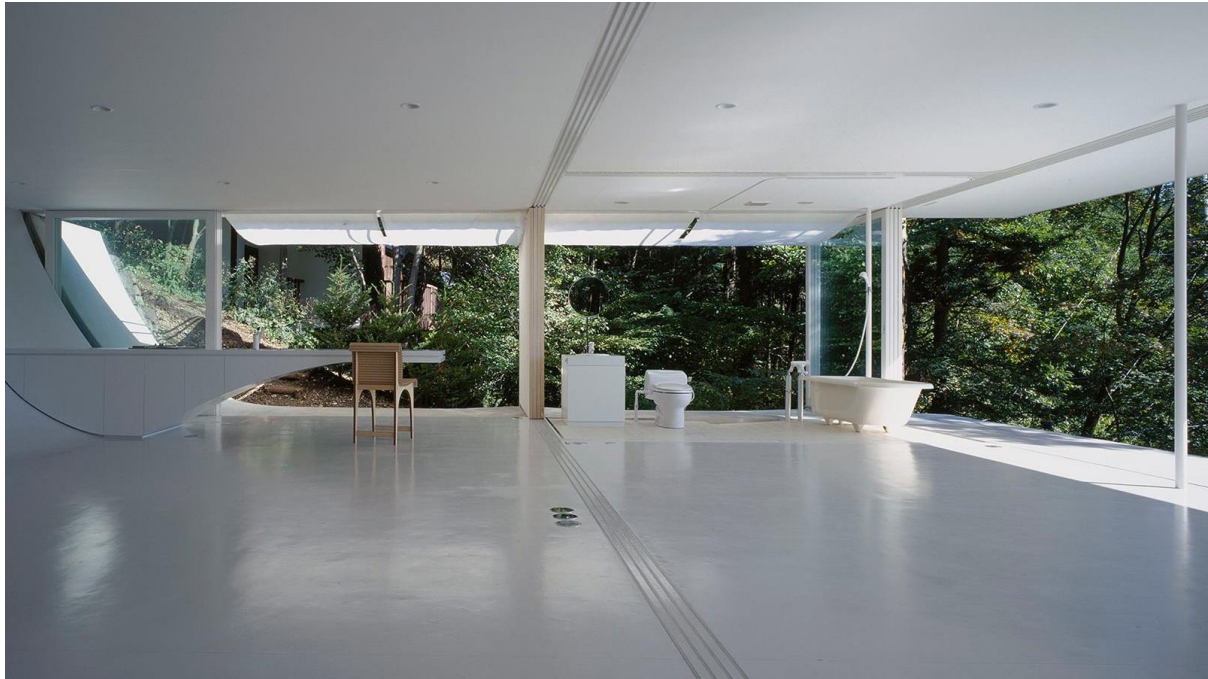
Figure 2: The interior of Ban's House Without Walls.

In its clean, sterile and almost surgical whiteness, this building could have been the backdrop for a science-fiction movie. As we'll see in section 3, it's not surprising then that Ridley Scott's 2018 movie Alien: Covenant contains an opening scene that feels eerily like Ban's House Without Walls .