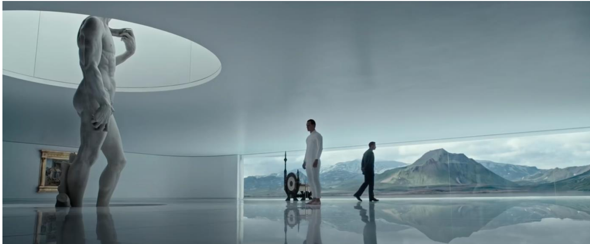
Figure 4: The high-modernist space in which the movie's prologue on human finitude takes place. Still from Alien: Covenant (20th Century Fox, 2017), directed by Ridley Scott.

More than anything, this space is spotless. It is uniformly white—the anti-color of purity. Its whiteness reduces everything within it to a self-contained object, and almost to a disturbance of the generically eternal order. It is a touch of genius that Scott has a selection of artworks included in the scene: two exemplars of Carlo Bugatti's Throne Chair ; a 1470 painting titled The Nativity by Piero della Francesca; the David by Michelangelo; and a Steinway grand piano. When the Synthetic in the scene is asked by his creator what his name is, he walks up to the David statue and answers "David." Just as Michelangelo's David physically represents and celebrates the perfect proportions of the human body, so too is the Synthetic perfect in all the ways that humans are not. This point is painfully hammered home in the following dialogue: