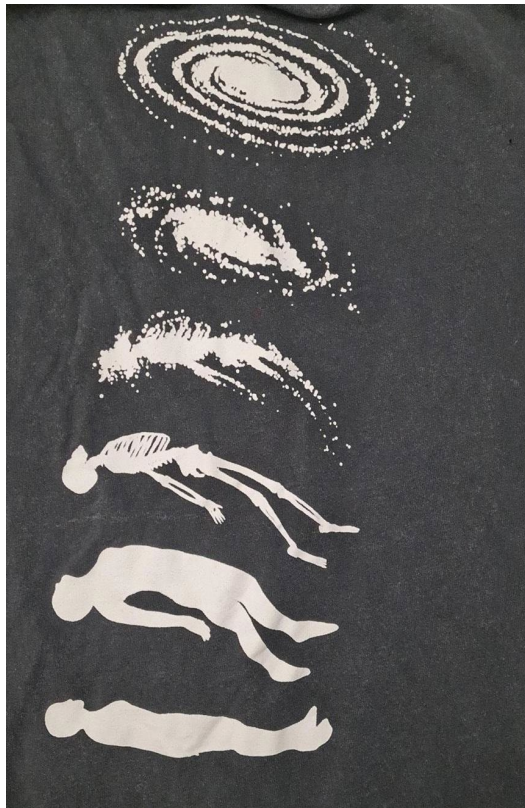
Spirals and Souls