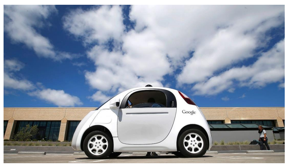
Self-driving cars are a myriad ethical quandaries on wheels.

URL = <a href="https://qz.com/1204395/self-driving-cars-trolley-problem-philosophers-are-building-ethical-algorithms-to-solve-the-problem/">https://qz.com/1204395/self-driving-cars-trolley-problem-philosophers-are-building-ethical-algorithms-to-solve-the-problem/</a>