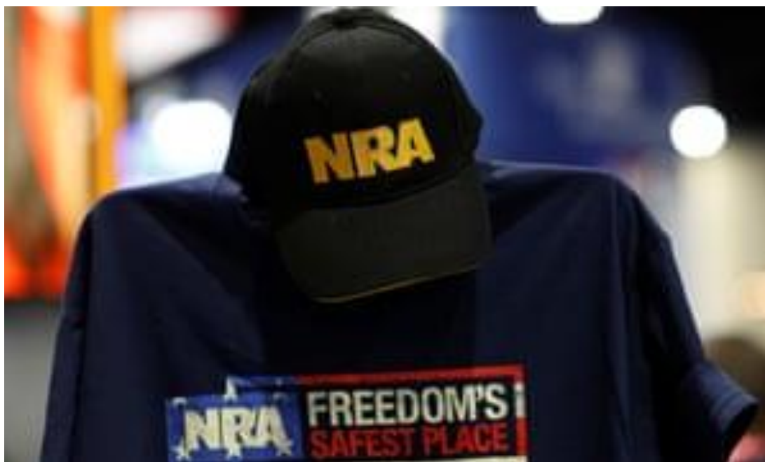
An NRA cap and shirt on display at the Conservative Political Action conference in Maryland on 23 February.

Full article available at URL = https://www.theguardian.com/us-news/2018/nov/09/nra-doctors-tweet-gun-control-deaths?CMP=share_btn_link